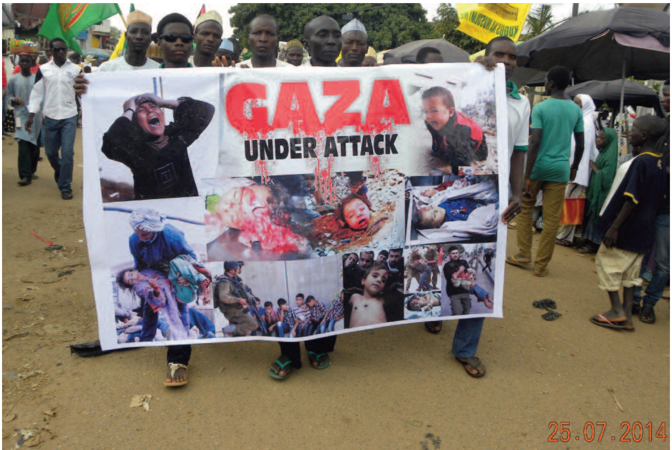
Banner in solidarity with Palestine