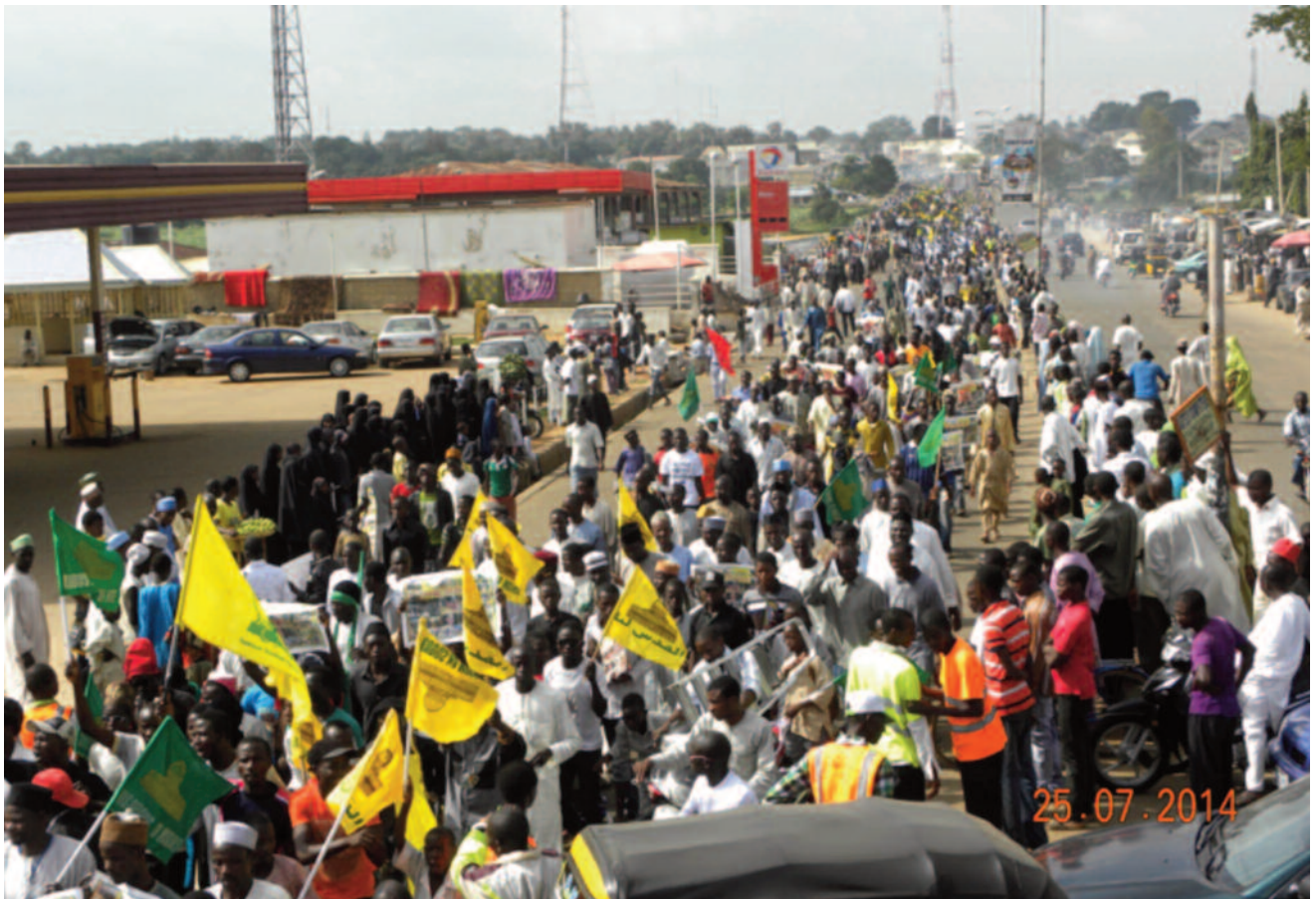
Mens section of procession