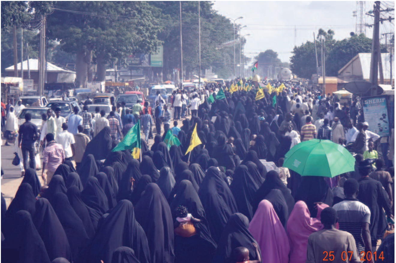
Women's section of procession