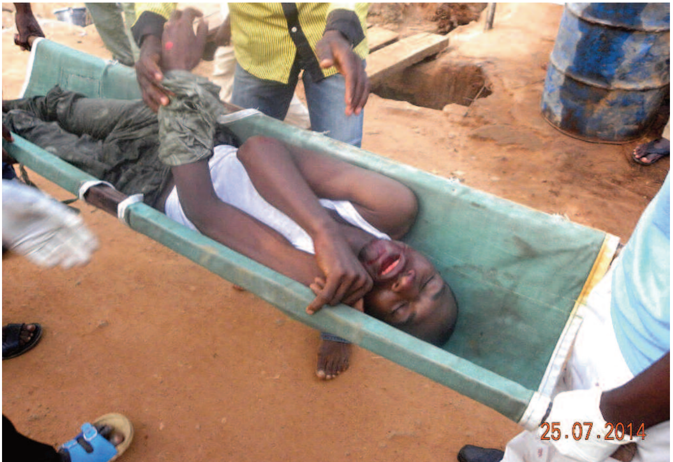
Injured taken to hospital