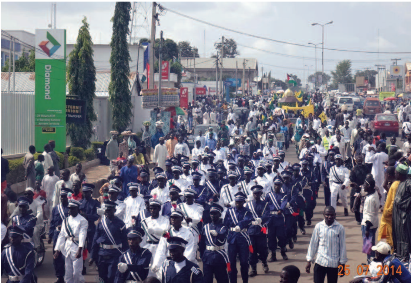
Another section of the peaceful procession