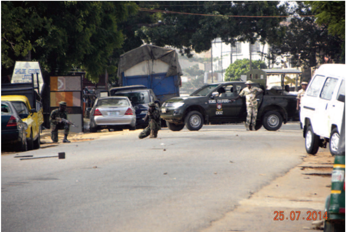
Soldiers shooting at protestors