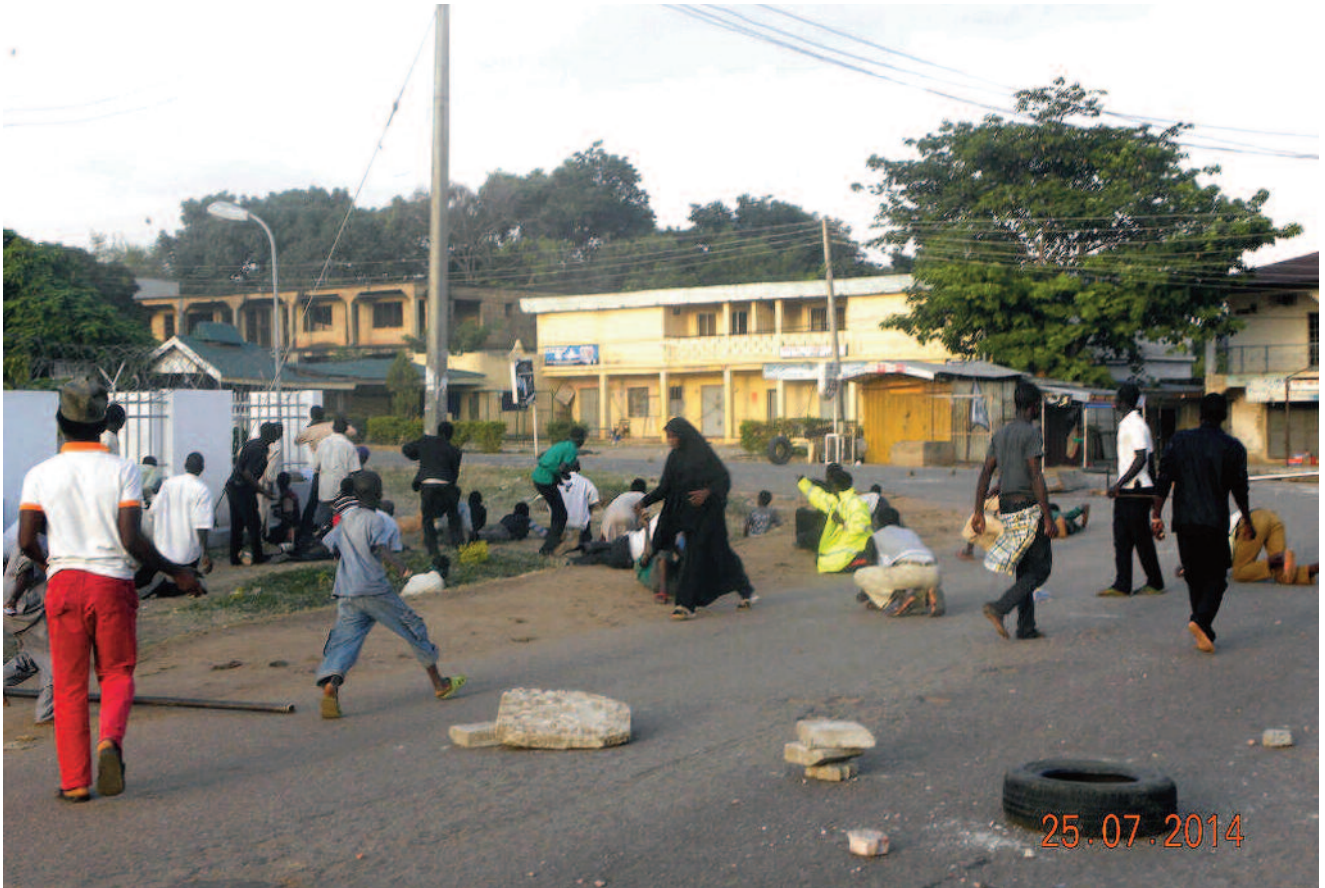
People seeking shelter during shooting