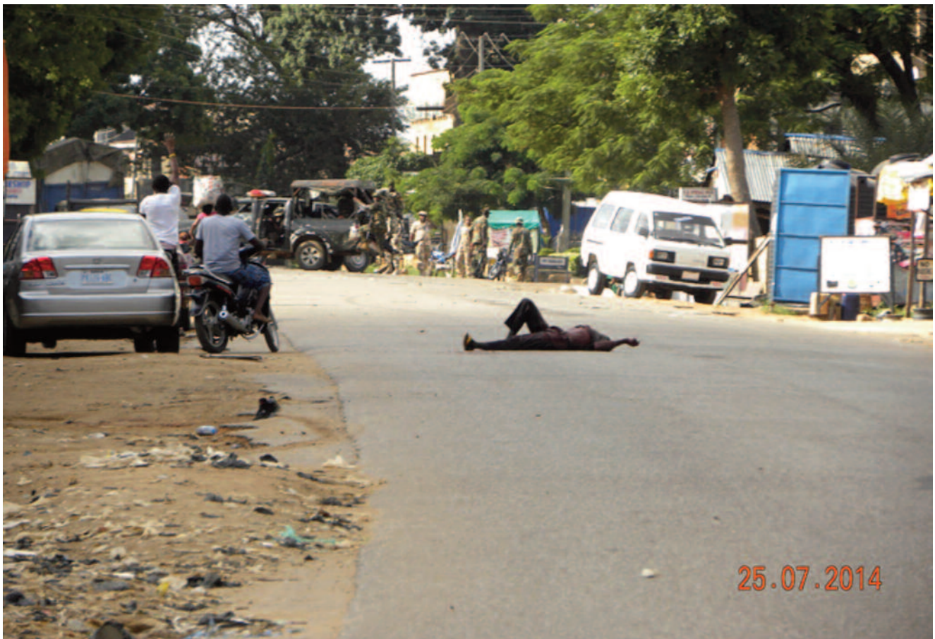
Injured man abandoned on the road and left for dead