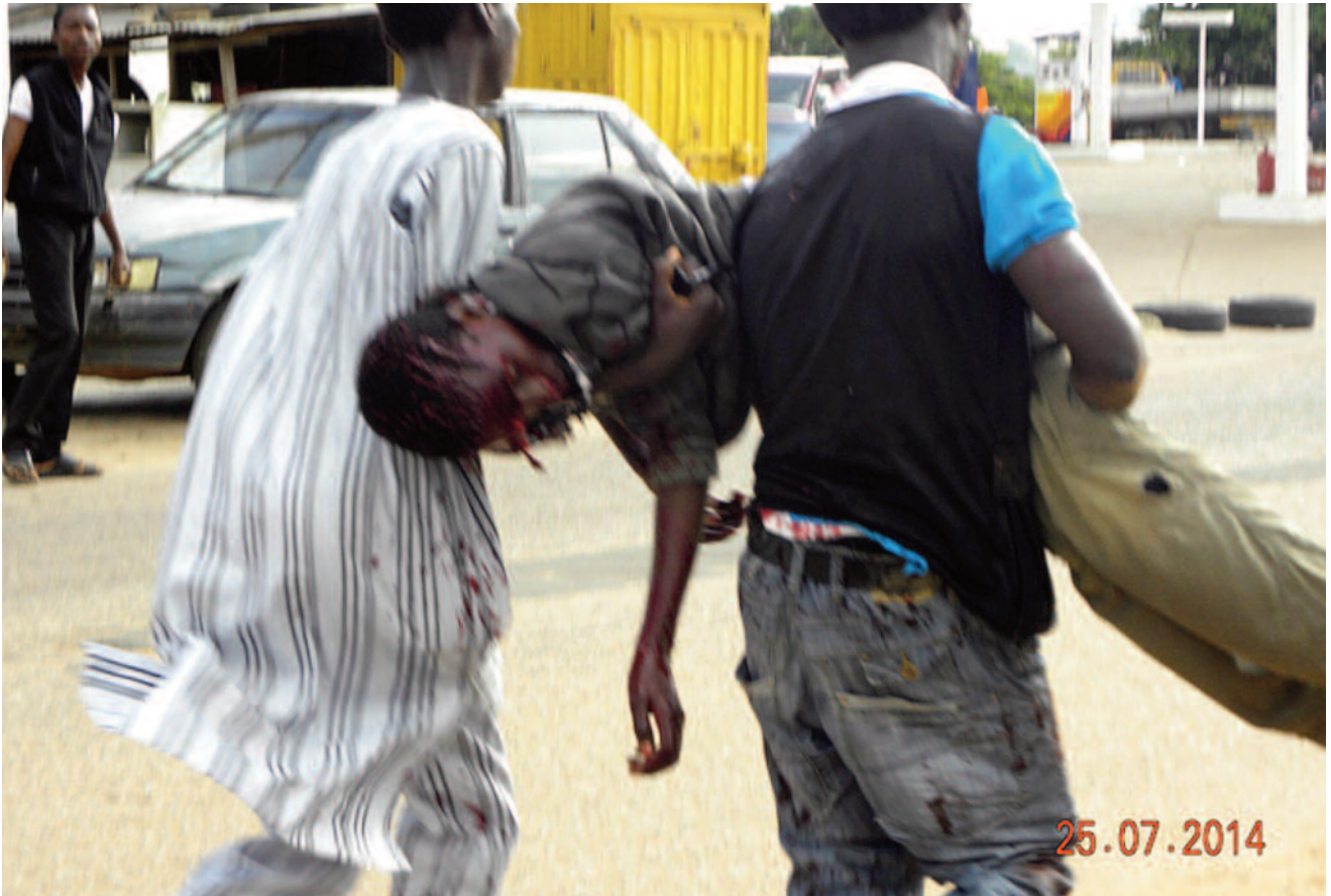
Wounded being carried by volunteers