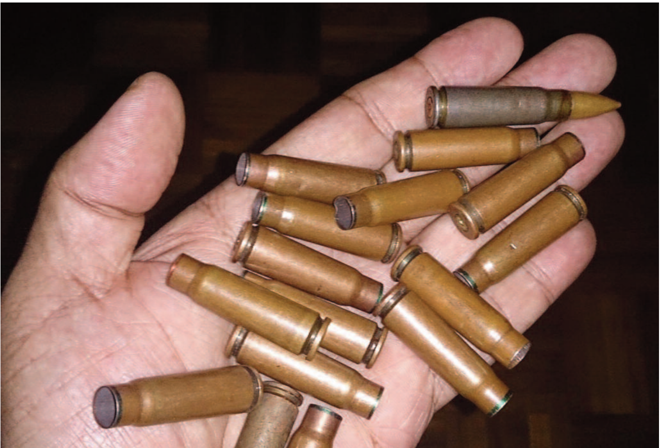
Ammunition collected at the site of the protest