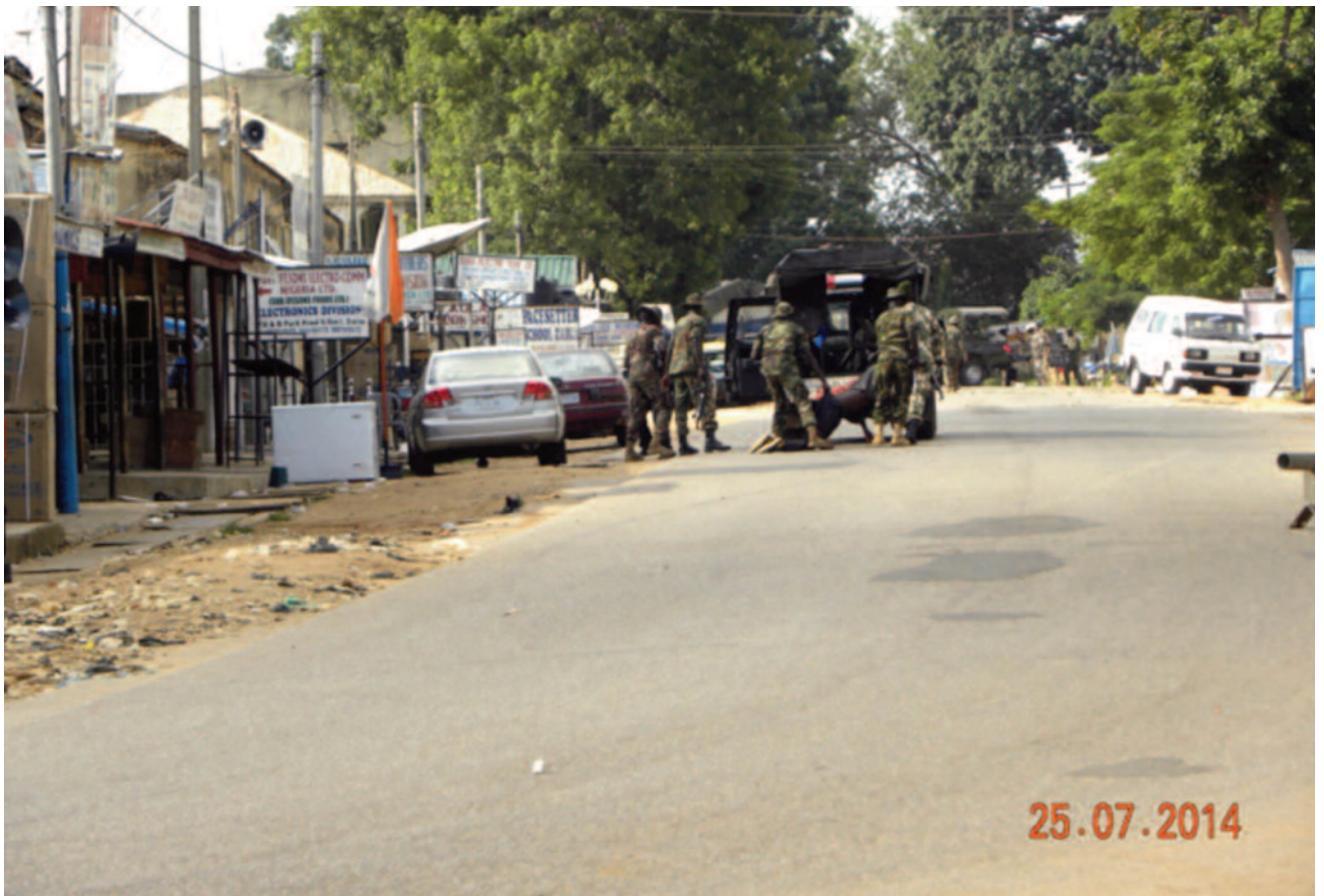
Army officers throwing lifeless body onto truck