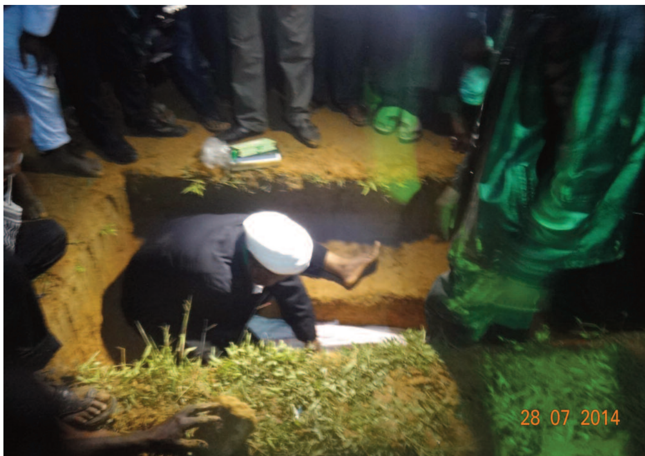
Burying the dead