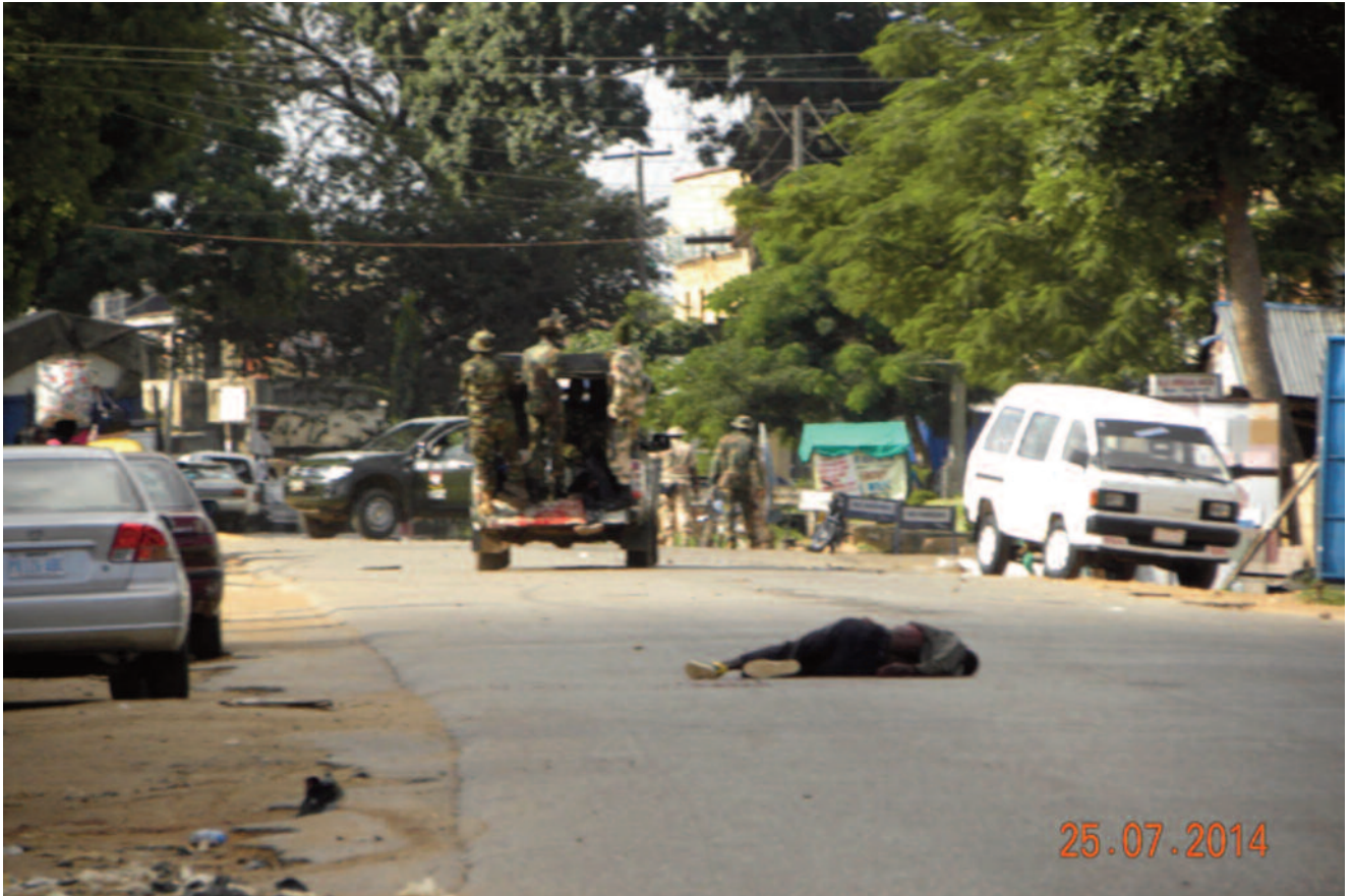
Injured man becomes limp