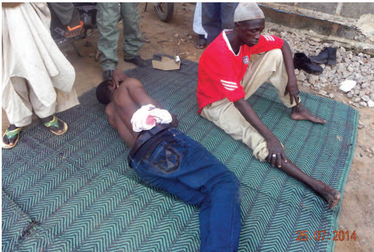
Injured waiting to be treated