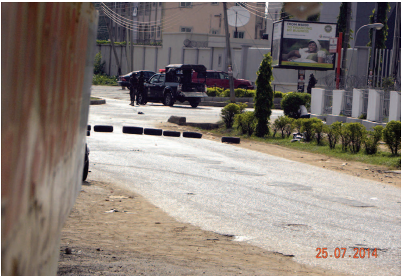
Army personnel alongside army vehicle